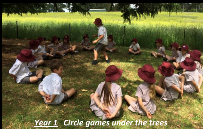
Year 1 Circle games under the trees