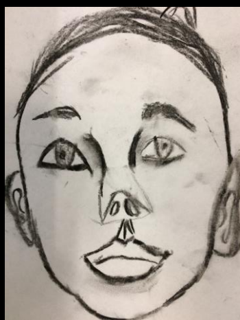
Years 3-6 Observational drawings