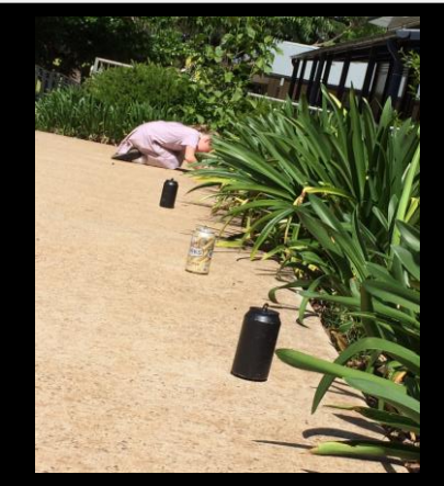
Year 3-6 have been conducting experiments about conducting/insulating heat.