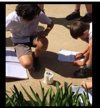
Term 4: Week 8 – 30th November 2016