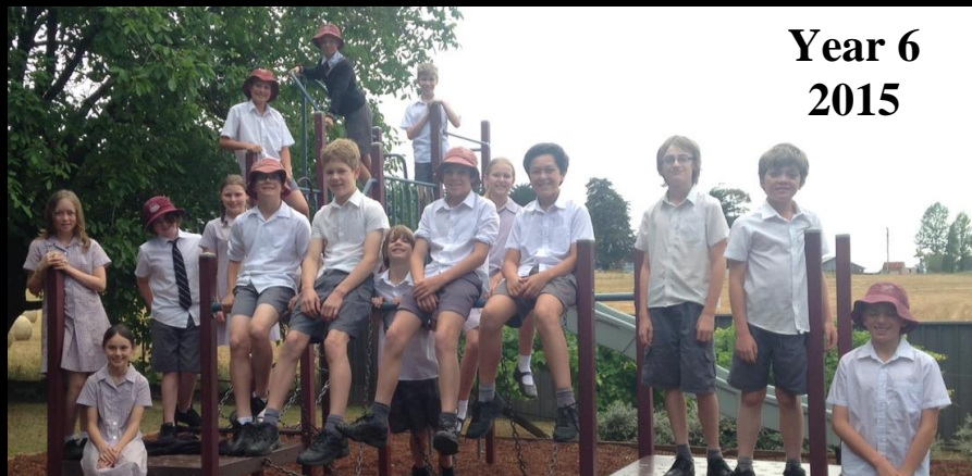
Year 6 2015